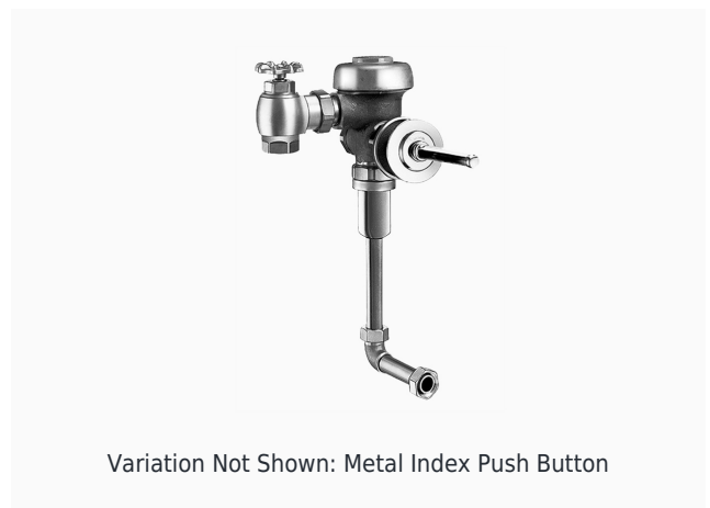
Variation Not Shown: Metal Index Push Button